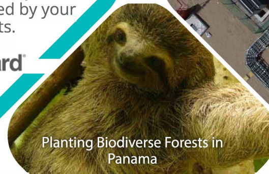
Planting Biodiverse Forests in Panama