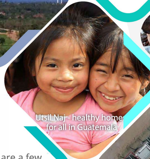
Utsil Naj - healthy home for all in Guatemala