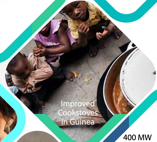
Improved Cookstoves in Guinea