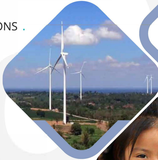
50 MW Wind Power Project in Madhya Pradesh, India